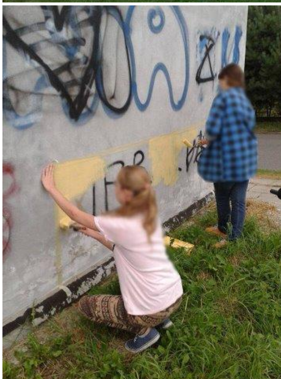
22. volunteers take part in Mezuzah project [phot. 15-16.].