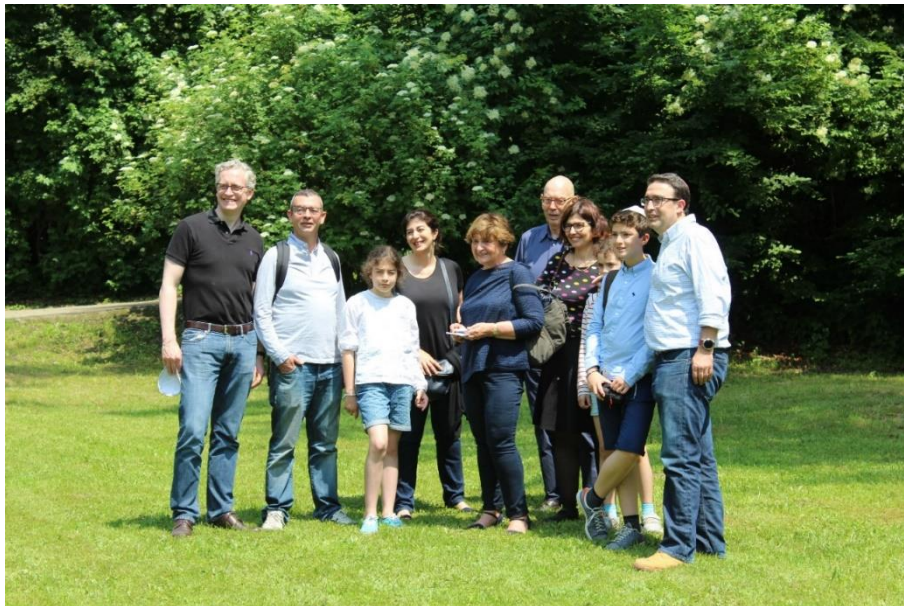
Photo 1. Ceremony in Zbylitowska Góra, 2016