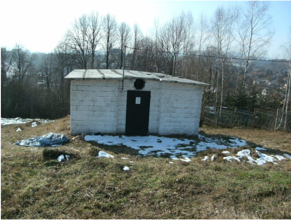
Photo 8. Ohel in Gorlice before renovation