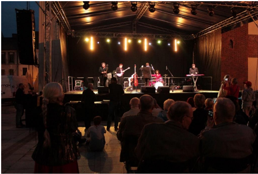
Photo. 2. Pushkin Klezmer Band, Rynek, 2016