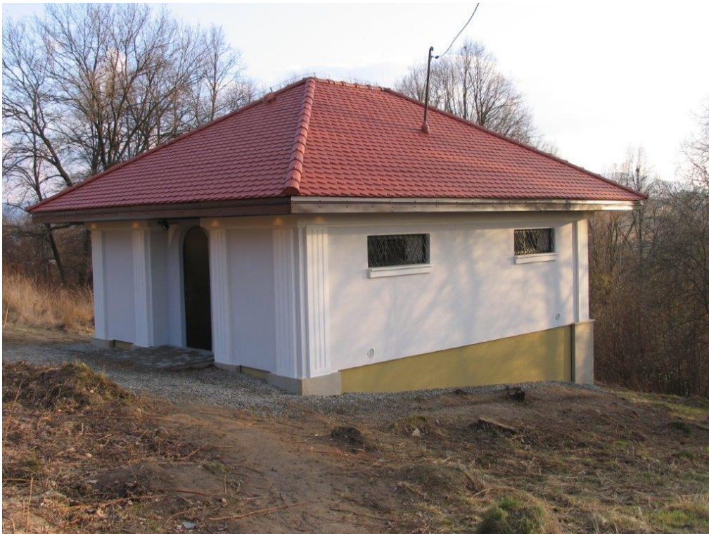
Photo 9. Ohel in Gorlice after renovation, 2016